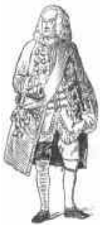
King George II 1683-1760

Georg Friedrich Handel was born in the German principality of Saxony. By age twelve he had mastered the keyboard and violin. In his teens, he was a Cathedral organist and began to study law, but abandoned both for a violinist's position in Hamburg's Goose Market Opera. In his early twenties, Handel went to Italy to develop his skills in opera composition, then returned to Germany as court musician to the Elector of Hanover (one of the princes of the Holy Roman Empire so titled because they elected the Emperor). He soon left for England where he spent his last fifty years. Ironically, when Queen Anne died, the new King George I was that very same Elector of Hanover whose service he had abandoned. Handel was one of Europe's foremost organists and a prolific composer. Although born in the same year as Johann Sebastian Bach, and is now considered a Baroque composer, he anticipated some of the musical emotion of the Romantic period. Romain Rolland, the influential French author and music critic, called Handel "a kind of Beethoven in chain... Beneath the classic ideal burned a romantic genius.