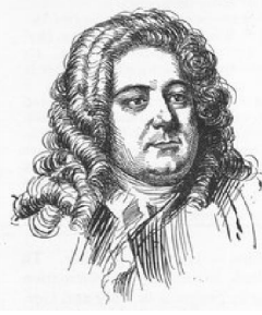
G.F. Handel 1685-1759

Georg Friedrich Handel was born in the German principality of Saxony. By age twelve he had mastered the keyboard and violin. In his teens, he was a Cathedral organist and began to study law, but abandoned both for a violinist's position in Hamburg's Goose Market Opera. In his early twenties, Handel went to Italy to develop his skills in opera composition, then returned to Germany as court musician to the Elector of Hanover (one of the princes of the Holy Roman Empire so titled because they elected the Emperor). He soon left for England where he spent his last fifty years. Ironically, when Queen Anne died, the new King George I was that very same Elector of Hanover whose service he had abandoned. Handel was one of Europe's foremost organists and a prolific composer. Although born in the same year as Johann Sebastian Bach, and is now considered a Baroque composer, he anticipated some of the musical emotion of the Romantic period. Romain Rolland, the influential French author and music critic, called Handel "a kind of Beethoven in chain... Beneath the classic ideal burned a romantic genius.